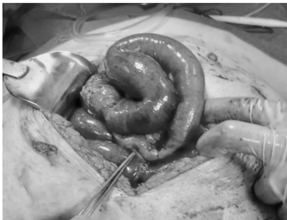
Fig. 1. Intraoperative findings of small bowel obstruction after GBP.

it was reduced in the abdomen and an extensive repair the wall defect with interrupted stitches. After a few hours, bowel were again open to gas and stool and clinical condition improved shortly after shortly after surgery. The day after the reoperation a liquid diet was started and on the 4th day after surgery another CT with oral contrast was performed, which discovered regular gastrointestinal transit Discharge was scheduled on postoperative day 7 and an outpatient appointment was booked. After 3 days from discharge, patient returned to the accident and emergency unit complaining with back pain and general discomfort. The patient underwent blood tests and CT of the abdomen. Blood tests showed an alteration of the hepatic profile with an increase in cholestasis indexes The abdomen CT showed marked distension of bilio-pancreatic loop and of the excluded stomach. adherent bridle and initial signs of suffering from stasis of the loops upstream". It was decided to send the patient to another surgical exploration. An internal hernia (IH) was found in the Petersen space with free fluid in the abdomen and distension of the excluded stomach and of the small bowel. IH was reduced and the entero - enteric anastomosis was de-rotated and refashioned. Enterotomy on the biliary loop and alimentary loop for decompression, was performed. Extensive adhesiolysis was performed and three drainages were left (one in Douglas space,